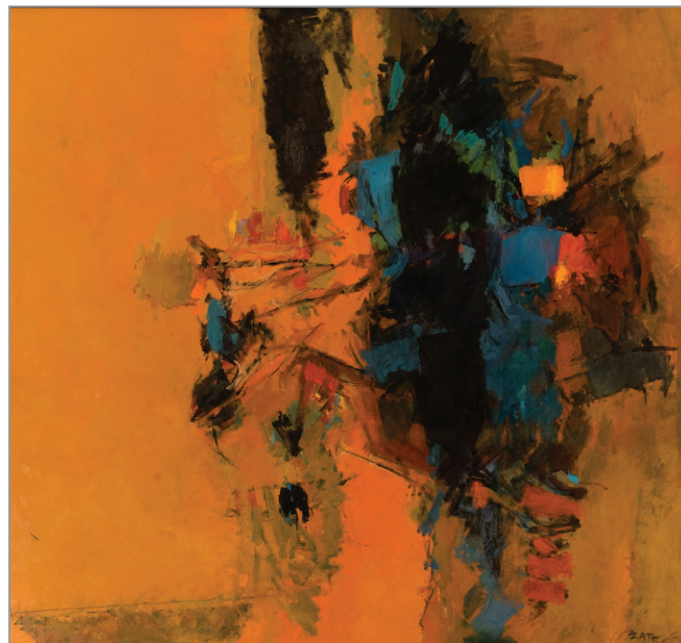
Interior #10, 1959 Oil on masonite, 72 x 78 ½ inches Mair Family Collection, Los Angeles Not in the exhibition

—Excerpted from an essay by Herman Cherry for the Walter Plate memorial exhibition, Woodstock Artists Association, 3 – 25 March 1984