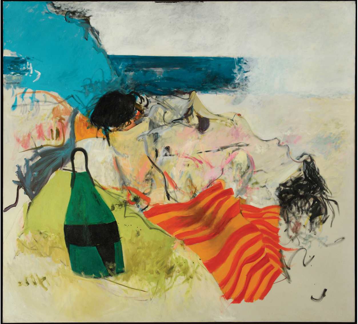
Georgica Beach - The Hamptons, 1971 Oil on canvas, 60 x 66 inches