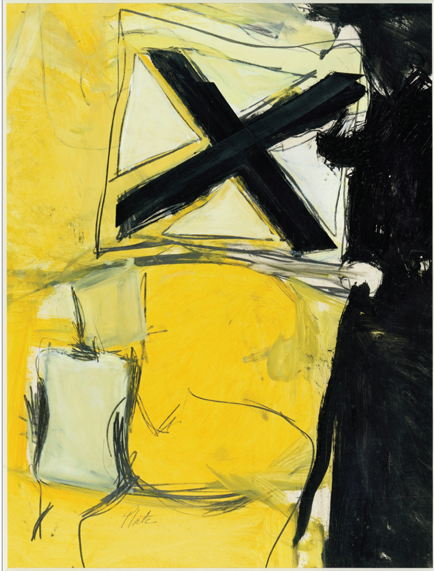
X + Yellow, 1968 Mixed media collage on paper, 24 x 20 inches