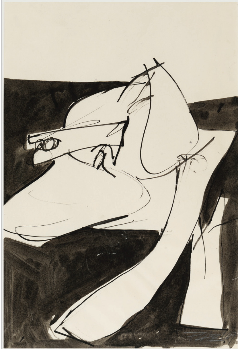
Beach Figures, 1969 Oil on paper, 17 ½ x 12 inches