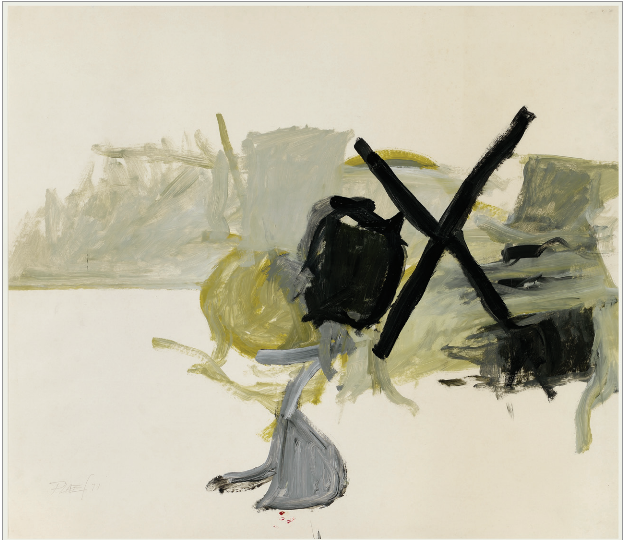
Behind the Dune, 1971 Mixed media on paper, 32 3/8 x 36 1/2 inches