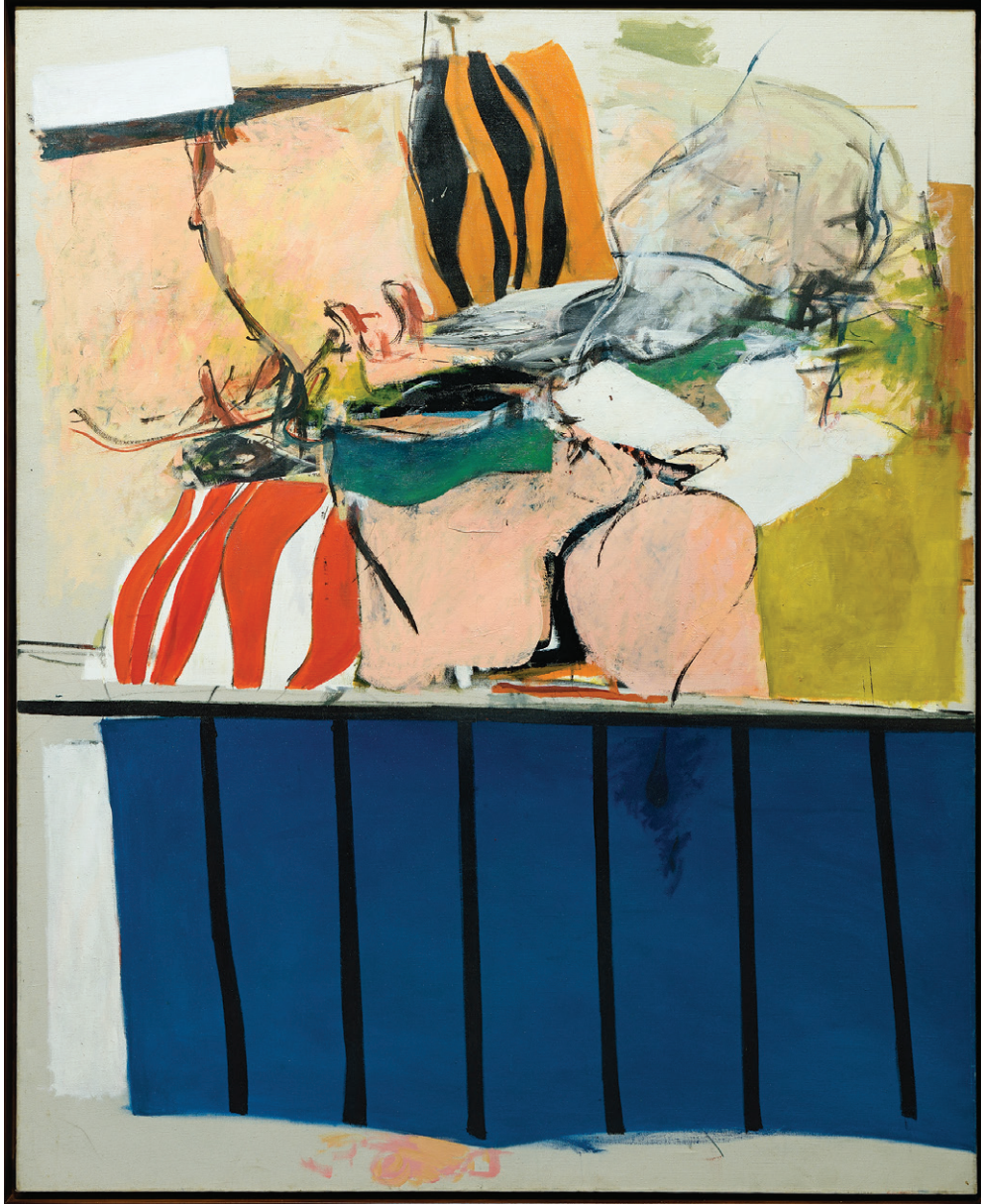
The Sunbather , 1968 Oil on canvas, 60 x 48 inches