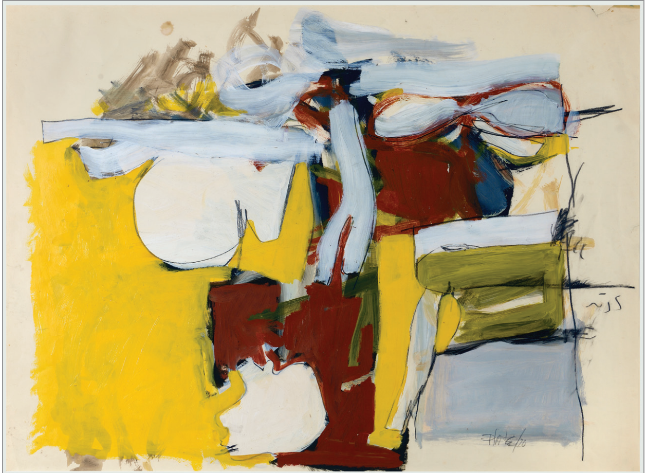
Masquerade , 1970 Oil on paper, 22 x 30 inches