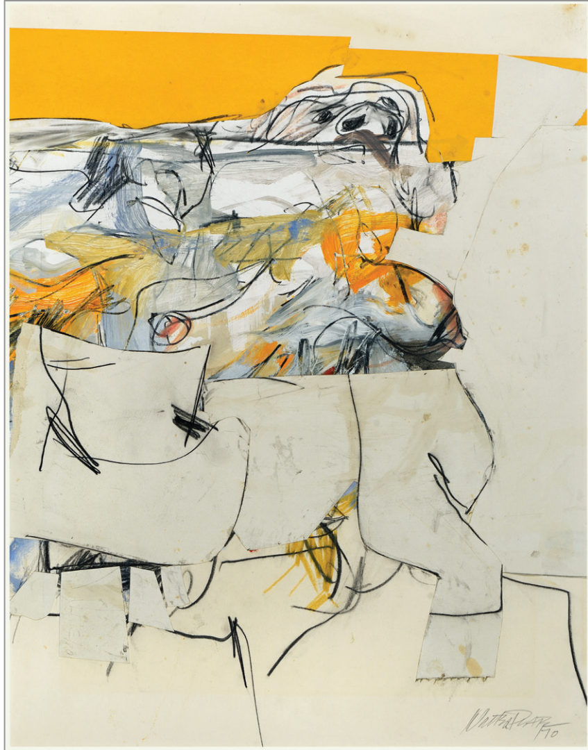
Woman, 1970 Mixed media on paper, 15 1/2 x 21 3/4 inches