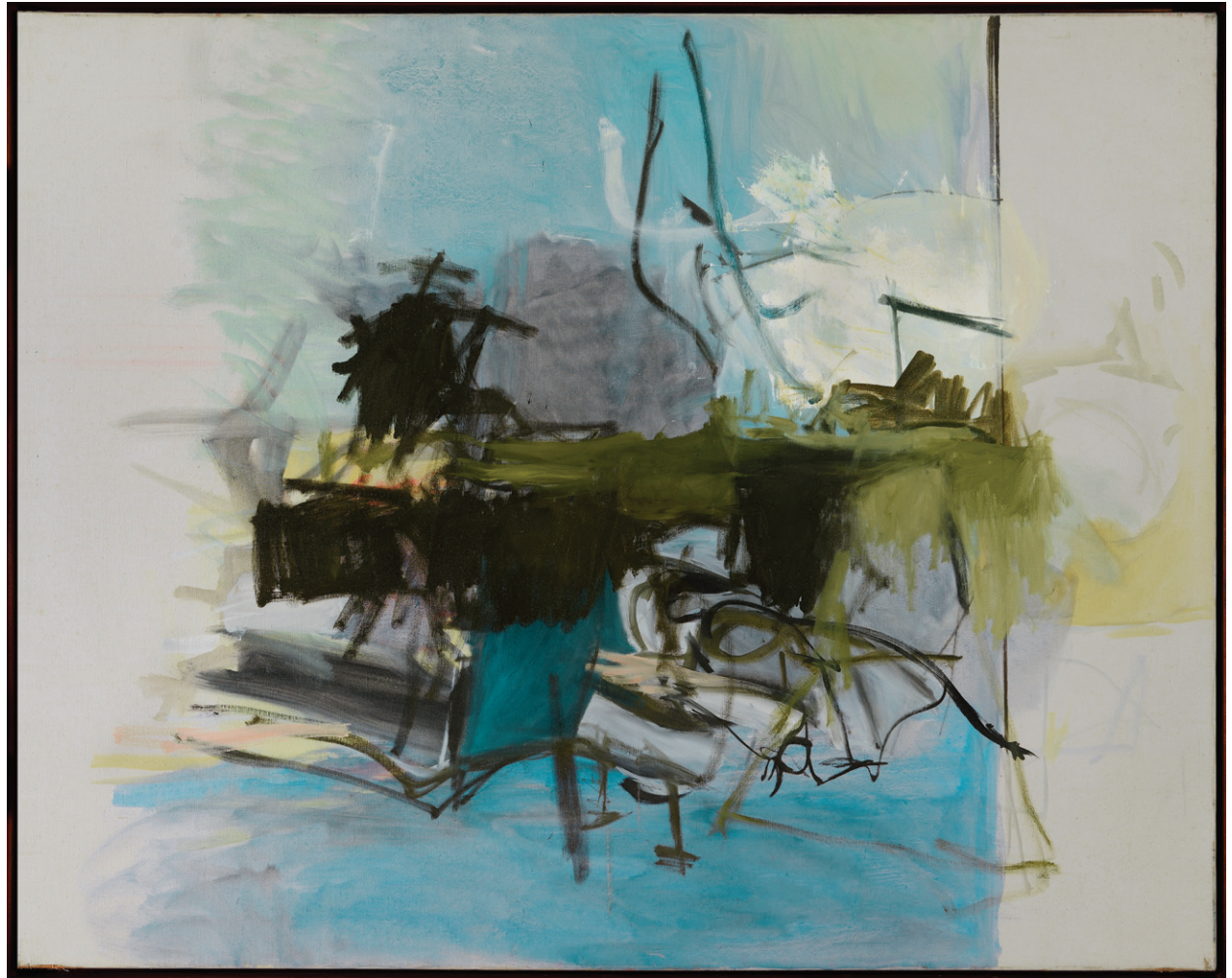
Beach Music, 1971 Oil canvas, 48 x 60 inches