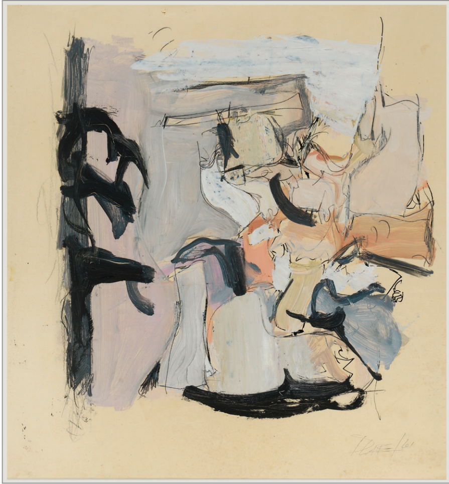
Surf , 1961 Mixed media on paper, 24 x 22 inches