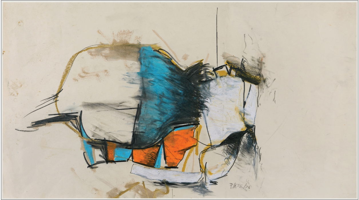
Chance Meeting, 1970 Mixed media on paper, 13 x 24 1/4 inches