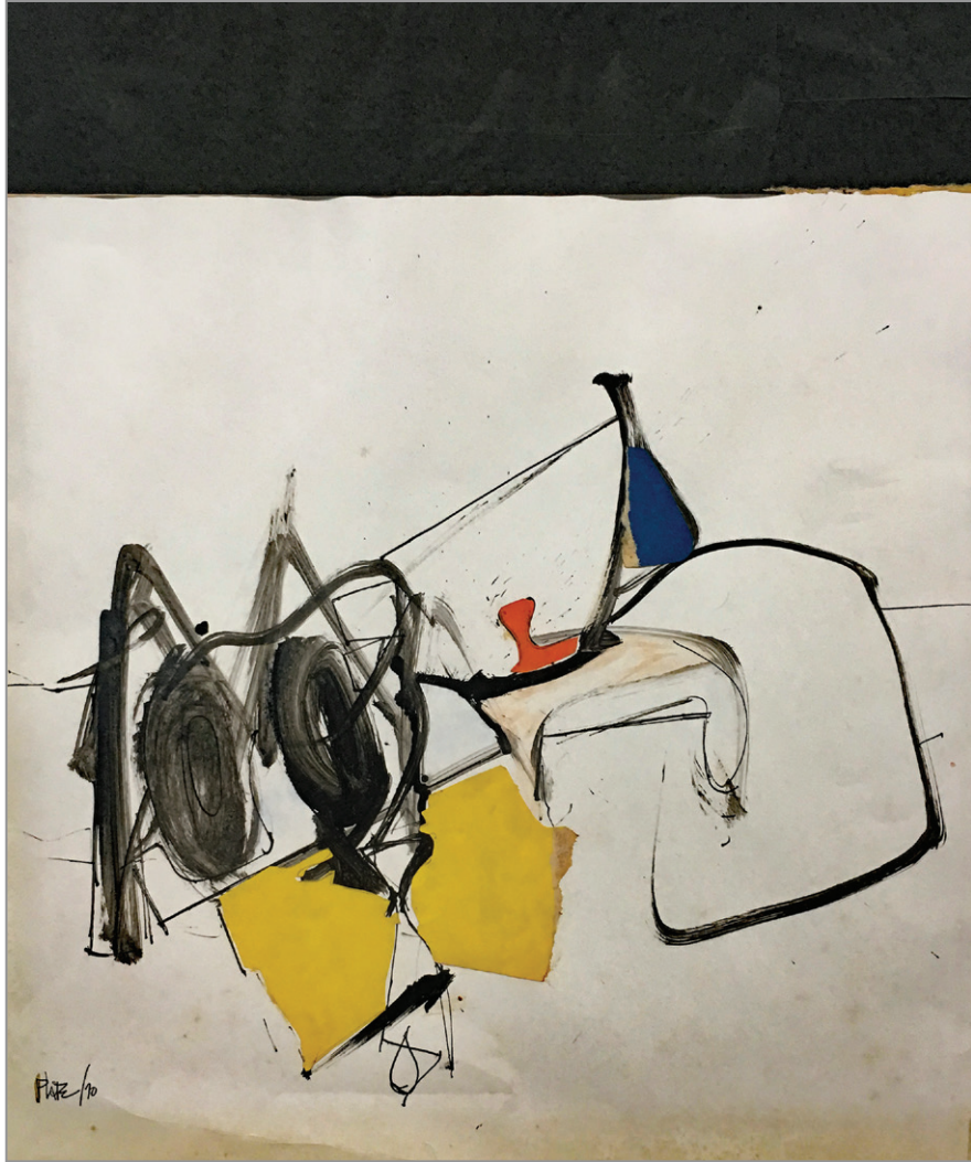
Beach Night, 1970 Oil on paper, 26 x 24 inches